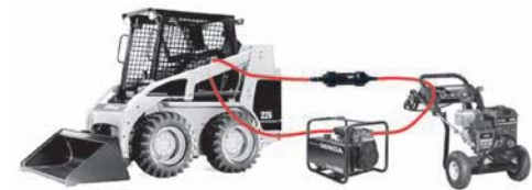
LOOP multiple pieces of equipment together